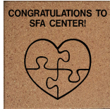
OPTION #3 8 x 8 brick w/ artwork $550