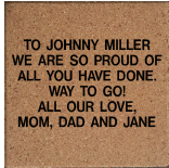
OPTION #2 8 x 8 brick $450